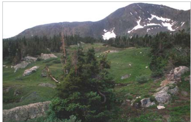
Rocky Mountain Alpine Zone

Alaskan and alpine tundra on relatively well-drained sites fit this fuel model. Grass and low shrubs are often present, but the principal fuel is a deep layer of lichens and moss. Fires in these fuels are not fast spreading or intense, but are difficult to extinguish.