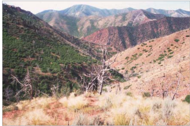
Western annual grasses such as cheatgrass, medusahead, ryegrass and fescues

This fuel model represents western grasslands vegetated by annual grasses and forbs. Brush or trees may be present but are very sparse, occupying less than one-third of the area. Examples of types where Fuel Model A should be used are cheatgrass and medusa-head. Open pinyon-juniper, sagebrush-grass, and desert shrub associations may appropriately be assigned this fuel model if the woody plants meet the density criteria. The quantity and continuity of the ground fuels vary greatly with rainfall from year to year.