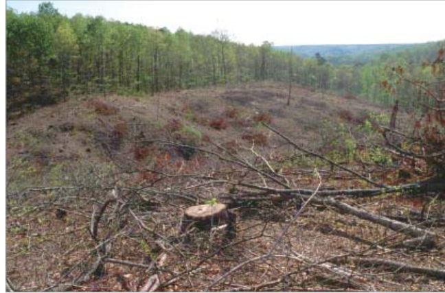
Appalachian Hardwood Clearcut

This model complements Fuel Model I. It is for clear-cuts and heavily thinned conifer stands where the total loading of material less than 6 inches in diameter is less than 25 tons per acre. Again as the slash ages, the fire potential will be overrated.