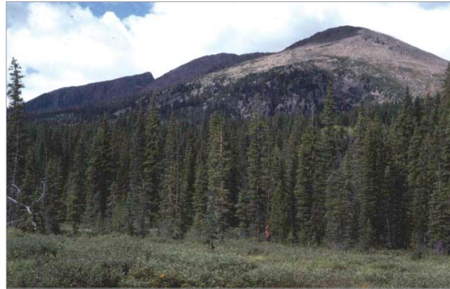
Rocky Mountain Lodgepine Pine Stand

This fuel model represents the closed stands of western long-needled pines. The ground fuels are primarily litter and small branchwood. Grass and shrubs are precluded by the dense canopy but may occur in the occasional natural opening. Fuel Model U should be used for ponderosa, Jeffery, sugar pine stands of the west and red pine stands of the Lake States. Fuel Model P is the corresponding model for southern pine plantations.