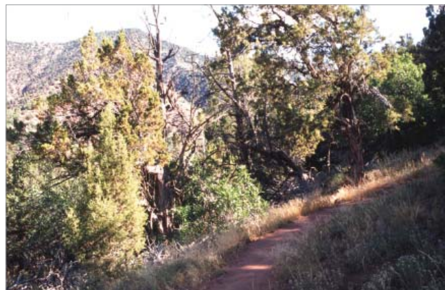
Pinyon - juniper stand