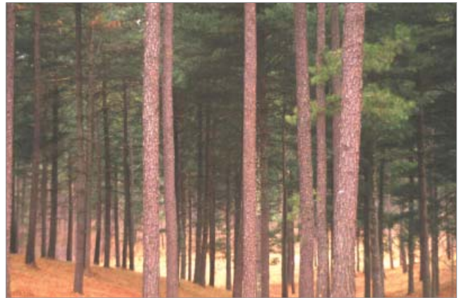
Open Eastern White Pine Stand

The short-needled conifers (white pines, spruces, larches, and firs) are represented by Fuel Model H. In contrast to Model G fuels, Fuel Model H describes a healthy stand with sparse undergrowth and a thin layer of ground fuels. Fires in the H fuels are typically slow spreading and are dangerous only in scattered areas where the downed woody material is concentrated.