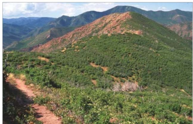
Pinyon Pine – Gambel Oak in the Southwest

Fuel Model F represents mature closed chamise stands and oak brush fields of Arizona, Utah, and Colorado. It also applies to young, closed stands and mature, open stands of California mixed chaparral. Open stands of pinyon-juniper are represented; however, fire activity will be overrated at low wind speeds and where there is sparse ground fuels.