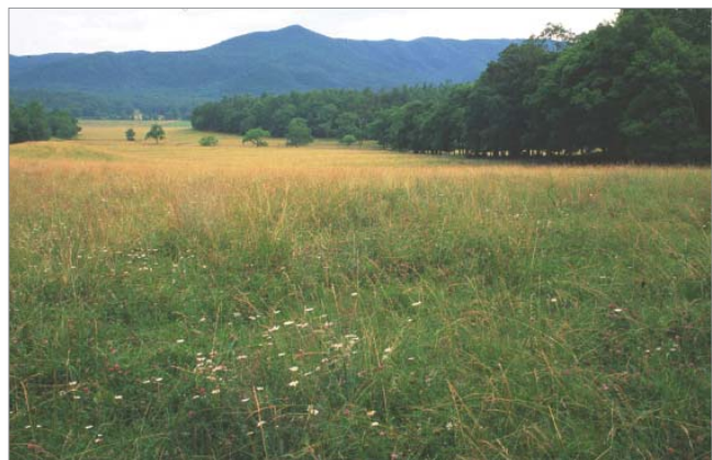
Eastern annual grasses such as fescue and broom sedge