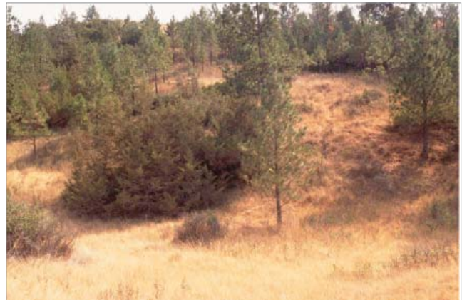
Open Ponderosa Pine Stand

Open pine stands typify Model C fuels. Perennial grasses and forbs are the primary ground fuel but there is enough needle litter and branch wood present to contribute significantly to the fuel loading. Some brush and shrubs may be present but they are of little consequence. Types covered by Fuel Model C are open, longleaf, slash, ponderosa, Jeffery, and sugar pine stands. Some pinyon-juniper stands may qualify.