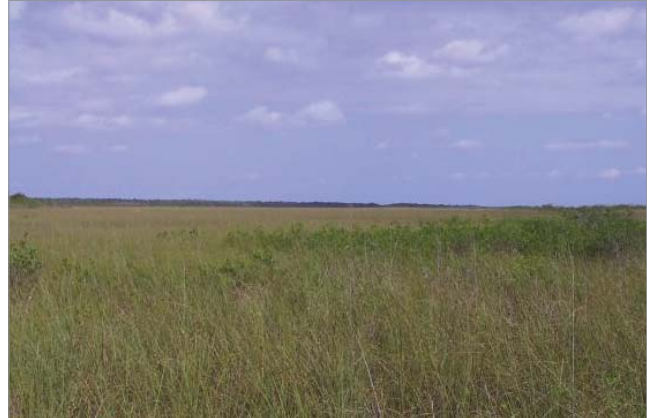
Sawgrass Prairie in South Florida

This fuel model was constructed specifically for the sawgrass prairies of south Florida. It may be useful in other marsh situations where the fuel is coarse and reedlike. This model assumes that one-third of the aerial portion of the plants is dead. Fast-spreading, intense fires can occur over standing water.