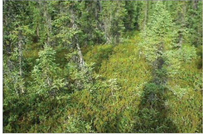
Alaska Black Spruce Stand

Upland Alaska black spruce is represented by Fuel Model Q. The stands are dense but have frequent openings filled with usually inflammable shrub species. The forest floor is a deep layer of moss and lichens, but there is some needle litter and small diameter branchwood. The branches are persistent on the trees, and ground fires easily reach into the crowns. This fuel model may be useful for jack pine stands in the Lake States. Ground fires are typically slow spreading, but a dangerous crowning potential exists. Users should be alert to such events and note those levels of SC and BI when crowning occurs.