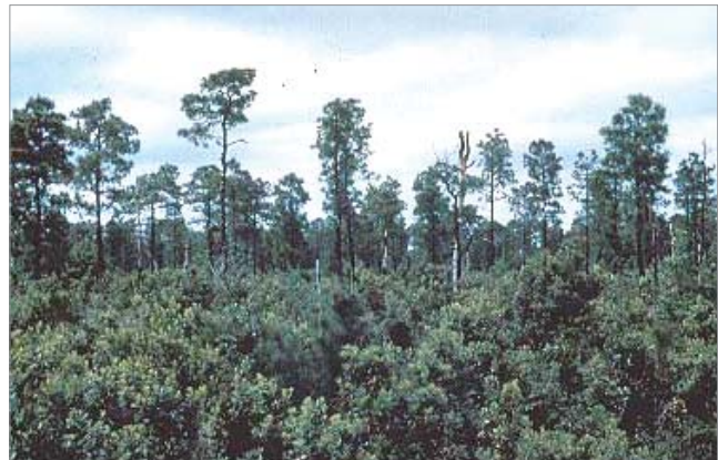
Southern Coastal Plain Pocosin Forest

The O fuel model applies to dense, brush like fuels of the Southeast. O fuels, except for a deep litter layer, are almost entirely living in contrast to B fuels. The foliage burns readily except during the active growing season. The plants are typically over 6 feet tall and are often found under open stands of pine. The high pocosins of the Virginia, North and South Carolina coasts are the ideal of Fuel Model O. If the plants do not meet the 6-foot criteria in those areas, Fuel Model D should be used.