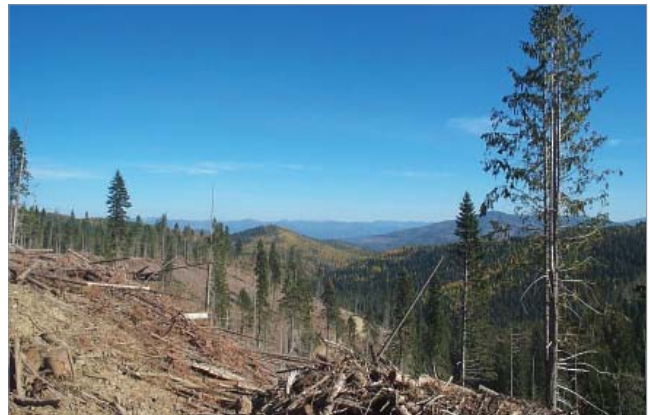
Clearcut in Pacific Northwest

Fuel Model I was designed for clear-cut conifer slash where the total loading of materials less than 6 inches in diameter exceeds 25 tons/acre. After settling and the fines (needles and twigs) fall from the branches, Fuel Model I will overrate the fire potential. For lighter loadings of clear-cut conifer slash, use Fuel Model J and for light thinnings and partial cuts where the slash is scattered under a residual overstory, use Fuel Model K.