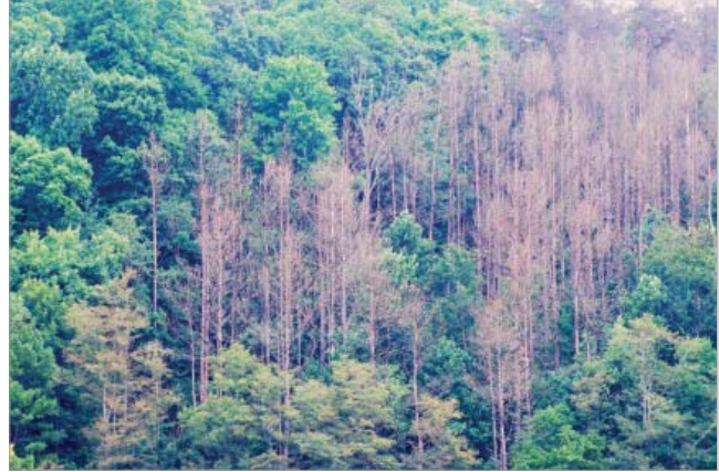
Southern pine beetle killed timber

Fuel Model G is used for dense conifer stands where there is a heavy accumulation of litter and down woody material. Such stands are typically over mature and may also be suffering insect, disease, wind or ice damage—natural events that create a very heavy buildup of dead material on the forest floor. The duff and litter are deep and much of the woody material is more than 3 inches in diameter. The undergrowth is variable, but shrubs are usually restricted to openings. Types meant to be represented by Fuel Model G are hemlock-Sitka spruce, Coastal Douglas-fir, and wind thrown or bug killed stands of lodgepole pine and spruce.