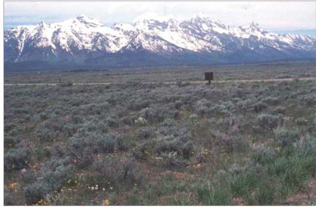
Sagebrush-grass Types of the Great Basin

The bothersome sagebrush-grass types of the Great Basin and the Intermountain West are characteristic of T fuels. The shrubs burn easily and are not dense enough to shade out grass and other herbaceous plants. The shrubs must occupy at least one-third of the site or the A or L fuel models should be used. Fuel Model T might be used for immature scrub oak and desert shrub associations in the West and the scrub oak-wire grass type of the Southeast.