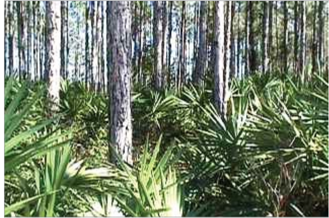
Palmetto-gallberry in southern coastal plains

This fuel model is specifically for the palmetto-gallberry, understory-pine association of the southeast coastal plains. It can also be used for the so-called “low pocosins” where Fuel Model O might be too severe. This model should only be used in the Southeast because of the high moisture of extinction associated with it.