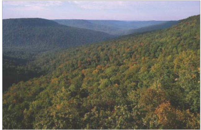
Appalachian Hardwood Forest

This fuel model represents the hardwood areas after the canopies leave out in the spring. It is provided as the off-season substitute for Fuel Model E. It should be used during the summer in all hardwood and mixed conifer-hardwood stands where more than half of the overstory is deciduous.