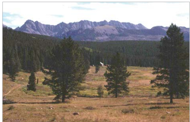
Rocky Mountain Open Lodgepole Pine Forest

This fuel model is meant to represent western grasslands vegetated by perennial grasses. The principal species are coarser and the loadings heavier than those in Model A fuels. Otherwise the situations are very similar; shrubs and trees occupy less than one-third of the area. The quantity of fuels in these areas is more stable from year to year. In sagebrush areas Fuel Model T may be more appropriate.