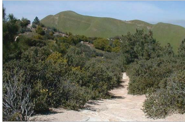
California mixed chaparral

Mature, dense fields of brush 6 feet or more in height are represented by this fuel model. One-fourth or more of the aerial fuel in such stands is dead. Foliage burns readily. Model B fuels are potentially very dangerous, fostering intense, fast-spreading fires. This model is for California mixed chaparral, generally 30 years or older. The F model is more appropriate for pure chamise stands. The B model may also be used for the New Jersey Pine Barrens.