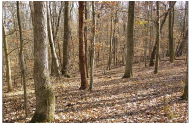
Appalachian Oak-hickory forest

Use this model after fall leaf fall for hardwood and mixed hardwood conifer types where the hardwoods dominate. The fuel is primarily hardwood leaf litter. The oak-hickory types are best represented by Fuel Model E, but E is an acceptable choice for northern hardwoods and mixed forests of the Southeast. In high winds, the fire danger may be underrated because rolling and blowing leaves are not accounted for. In the summer after the trees have leafed out, Fuel Model E should be replaced by Fuel Model R.