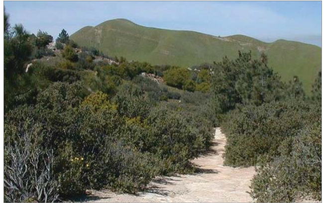
California mixed chaparral

Mature, dense fields of brush 6 feet or more in height are represented by this fuel model. One-fourth or more of the aerial fuel in such stands is dead. Foliage burns readily. Model B fuels are potentially very dangerous, fostering intense, fast-spreading fires. This model is for California mixed chaparral, generally 30 years or older. The F model is more appropriate for pure chamise stands. The B model may also be used for the New Jersey Pine Barrens.