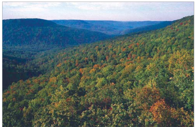
Appalachian hardwood forest

This fuel model represents the hardwood areas after the canopies leaf out in the spring. It is provided as the off-season substitute for Fuel Model E. It should be used during the summer in all hardwood and mixed conifer-hardwood stands where more than half of the overstory is deciduous.