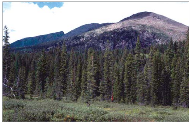
Rocky Mountain lodgepole pine stand

Fuel Model U (#9) .....This fuel model represents the closed stands of western long-needled pines. The ground fuels are primarily litter and small branch wood. Grass and shrubs are precluded by the dense canopy but may occur in the occasional natural opening. Fuel Model U should be used for ponderosa, Jeffery, and sugar pine stands of the West and red pine stands of the Lake States. Fuel Model P is the corresponding model for southern pine plantations.