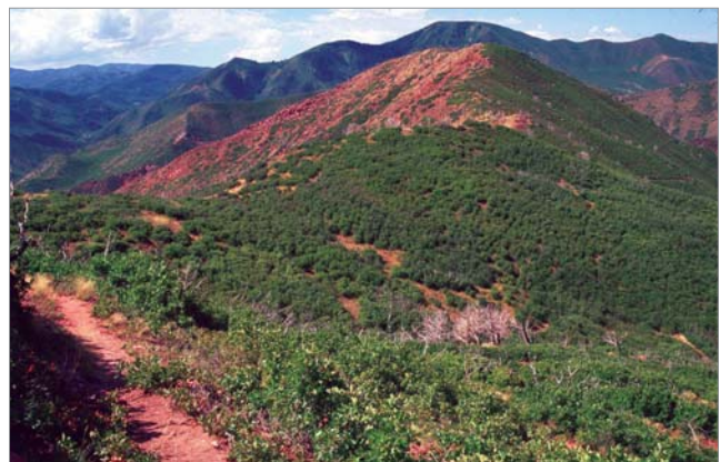
Pinyon Pine – Gambel Oak in the Southwest

Fuel Model F represents mature closed chamise stands and oak brush fields of Arizona, Utah, and Colorado. It also applies to young, closed stands and mature, open stands of California mixed chaparral. Open stands of pinyon-juniper are represented; however, fire activity will be overrated at low wind speeds and where there are sparse ground fuels.