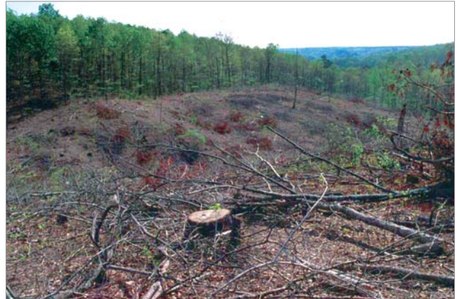
Appalachian hardwood clearcut

This model complements Fuel Model I. It is for clear-cuts and heavily thinned conifer stands where the total loading of material less than 6 inches in diameter is less than 25 tons per acre. Again, as the slash ages, the fire potential will be overrated.