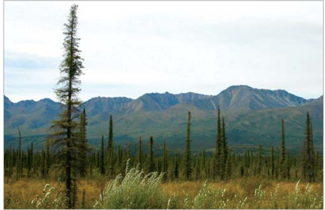
Alaska black spruce stand

Upland Alaska black spruce is represented by Fuel Model Q. The stands are dense but have frequent openings filled with usually inflammable shrub species. The forest floor is a deep layer of moss and lichens, but there is some needle litter and small diameter branchwood. The branches are persistent on the trees, and ground fires easily reach into the crowns. This fuel model may be useful for jack pine stands in the Lake States. Ground fires are typically slow spreading, but a dangerous crowning potential exists. Users should be alert to such events and note those levels of spread component and burning index when crowning occurs.