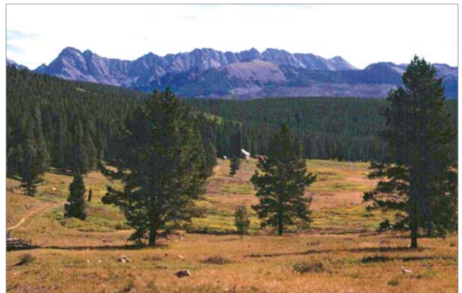
Rocky Mountain open lodgepole pine forest

This fuel model is meant to represent western grasslands vegetated by perennial grasses. The principal species are coarser and the loadings heavier than those in Model A fuels. Otherwise the situations are very similar; shrubs and trees occupy less than one-third of the area. The quantity of fuels in these areas is more stable from year to year. In sagebrush areas, Fuel Model T may be more appropriate.