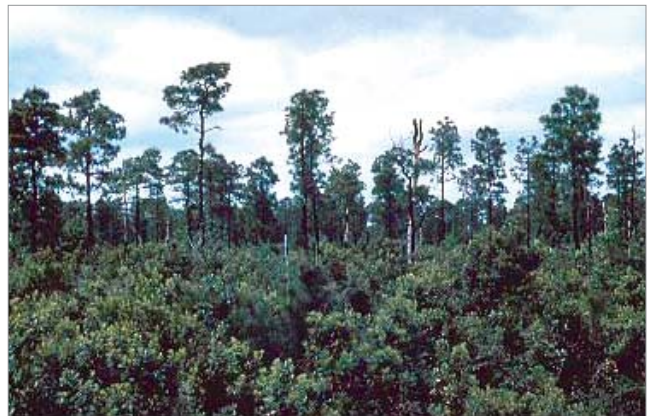
Southern coastal plain pocosin forest

The O fuel model applies to dense, brush-like fuels of the Southeast. O fuels, except for a deep litter layer, are almost entirely living in contrast to B fuels. The foliage burns readily except during the active growing season. The plants are typically over 6 feet tall and are often found under open stands of pine. The high pocosins of the Virginia and North and South Carolina coasts are the ideal of Fuel Model O. If the plants do not meet the 6-foot criteria in those areas, Fuel Model D should be used.