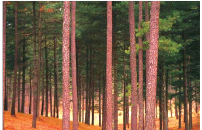
Open Eastern white and red pines

The short-needled conifers (white pines, spruces, larches, and firs) are represented by Fuel Model H. In contrast to Model G fuels, Fuel Model H describes a healthy stand with sparse undergrowth and a thin layer of ground fuels. Fires in the H fuels are typically slow spreading and are dangerous only in scattered areas where the downed woody material is concentrated.