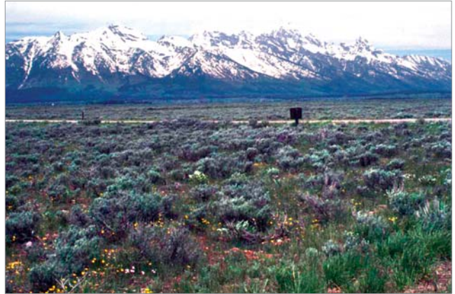
Sagebrush-grass types of the Great Basin

The sagebrush-grass types of the Great Basin and the Intermountain West are characteristic of T fuels. The shrubs burn easily and are not dense enough to shade out grass and other herbaceous plants. The shrubs must occupy at least one-third of the site or the A or L fuel models should be used. Fuel Model T might be used for immature scrub oak and desert shrub associations in the West and the scrub oak-wire grass type of the Southeast.