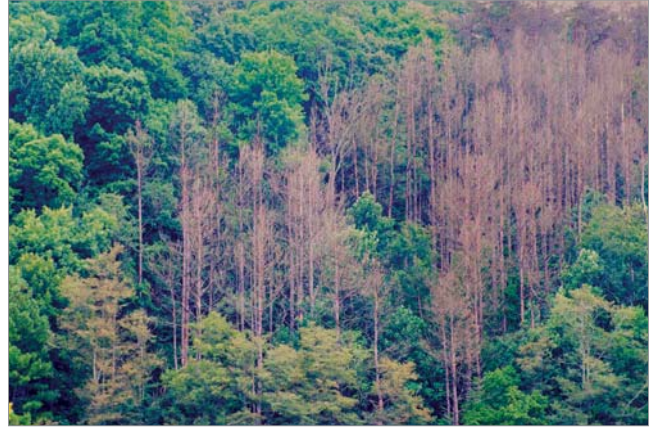
Southern pine beetle killed timber

Fuel Model G is used for dense conifer stands where there is a heavy accumulation of litter and downed woody material. Such stands are typically overly mature and may also be suffering insect, disease, wind, or ice damage—natural events that create a very heavy buildup of dead material on the forest floor. The duff and litter are deep and much of the woody material is more than 3 inches in diameter. The undergrowth is variable, but shrubs are usually restricted to openings. Types meant to be represented by Fuel Model G are hemlock-Sitka spruce, coastal Douglas-fir, and wind-thrown or bug-killed stands of lodgepole pine, southern pine, and spruce.