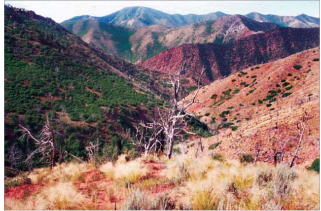
Western annual grasses such as cheatgrass, medusahead, ryegrass, and fescues

This fuel model represents western grasslands populated by annual grasses and forbs. Brush or trees may be present but are very sparse, occupying less than one-third of the area. Examples of types where Fuel Model A should be used are cheatgrass and medusahead. Open pinyon-juniper, sagebrush-grass, and desert shrub associations may appropriately be assigned this fuel model if the woody plants meet the density criteria. The quantity and continuity of the ground fuels vary greatly with rainfall from year to year.