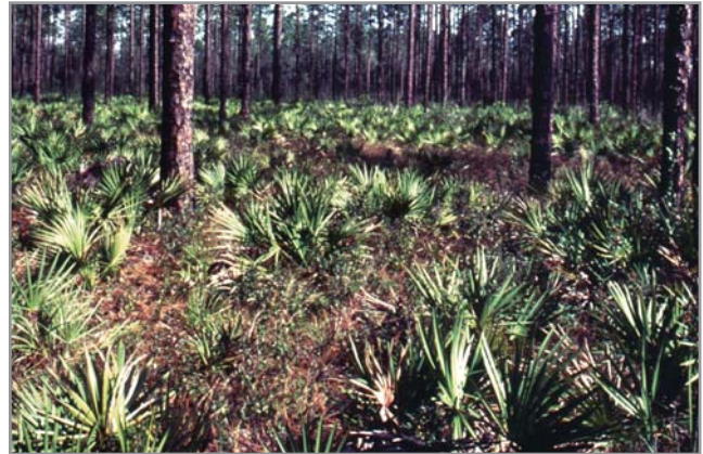
Palmetto-gallberry in southern coastal plains

This fuel model is specifically for the palmetto-gallberry, understory-pine association of the southeast coastal plains. It can also be used for the so-called “low pocosins” where Fuel Model O might be too severe. This model should only be used in the Southeast because of the high moisture of extinction associated with it.