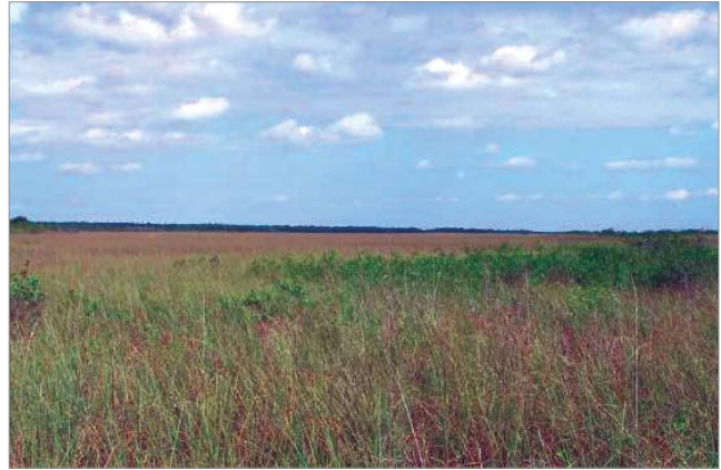
Sawgrass prairie in south Florida

This fuel model was constructed specifically for the sawgrass prairies of south Florida. It may be useful in other marsh situations where the fuel is coarse and reedlike. This model assumes that one-third of the aerial portion of the plants is dead. Fast-spreading, intense fires can occur over standing water.