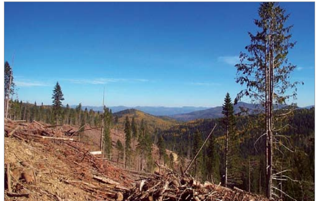
Clearcut in Pacific Northwest

Fuel Model I was designed for clearcut conifer slash where the total loading of materials less than 6 inches in diameter exceeds 25 tons/acre. After settling and the fines (needles and twigs) fall from the branches, Fuel Model I will overrate the fire potential. For lighter loadings of clearcut conifer slash, use Fuel Model J and for light thinnings and partial cuts where the slash is scattered under a residual overstory, use Fuel Model K.