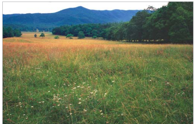
Eastern annual grasses such as fescue and broom sedge