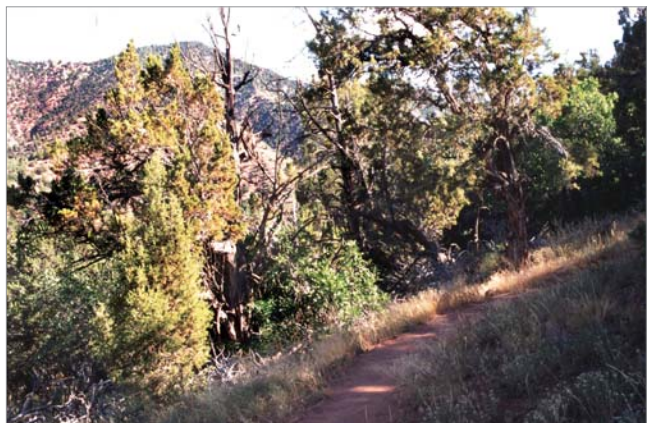
Pinyon - juniper stand