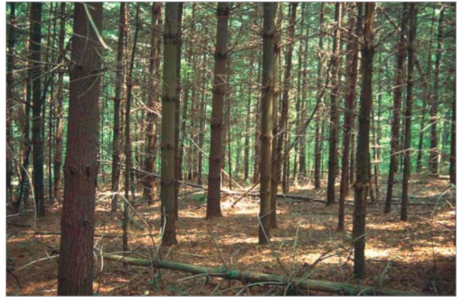
Thinned Eastern white pine stand

Slash fuels from light thinnings and partial cuts in conifer stands are represented by Fuel Model K. Typically the slash is scattered about under an open overstory. This model applies to hardwood slash and to southern pine clearcuts where loading of all fuels is less than 15 tons/acre.