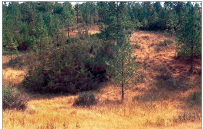
Open ponderosa pine stand

Open pine stands typify Model C fuels. Perennial grasses and forbs are the primary ground fuel but there is enough needle litter and branch wood present to contribute significantly to the fuel loading. Some brush and shrubs may be present but they are of little consequence. Types covered by Fuel Model C are open, long-leaf, slash, ponderosa, Jeffery, and sugar pine stands. Some pinyon-juniper stands may qualify.